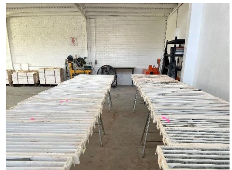
Galt Discovery Centre